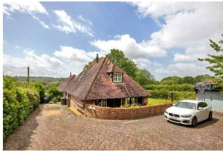
ASH VIEW, TN17 1LN