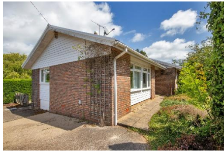
WHITE GABLES, TN17 1LA