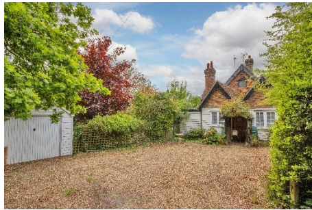
1 BRANDFOLD COTTAGES, TN17 1JJ