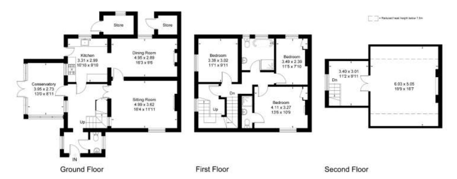
Surveyed and drawn in accordance with the International Property Measurement Standards (IPMS 2: Residential) fourwalls-group.com 297715