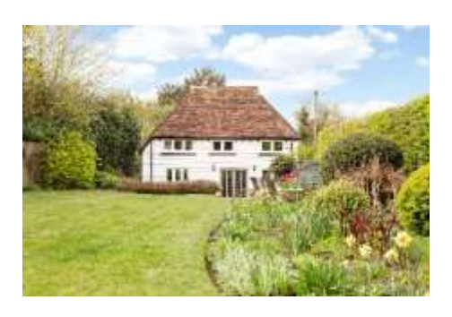
TUDOR COTTAGE, ME17 4LF