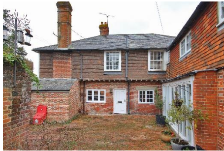
3 THE MEWS, TN17 1AE

Harpers and Hurlingham Property Consultants The Corner House, Stone Street, Cranbrook, Kent TN17 3HE Tel: 01580 715400 enquiries@harpersandhurlingham.com www.harpersandhurlingham.com