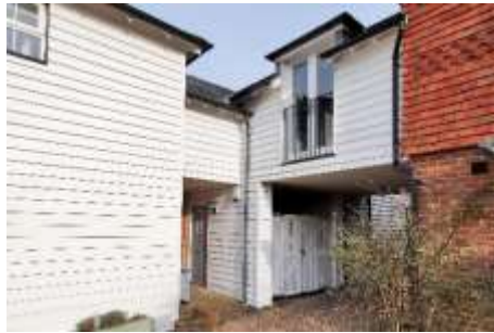
3 CULPEPPER MEWS, TN17 1AQ

Harpers and Hurlingham Property Consultants The Corner House, Stone Street, Cranbrook, Kent TN17 3HE Tel: 01580 715400 enquiries@harpersandhurlingham.com www.harpersandhurlingham.com