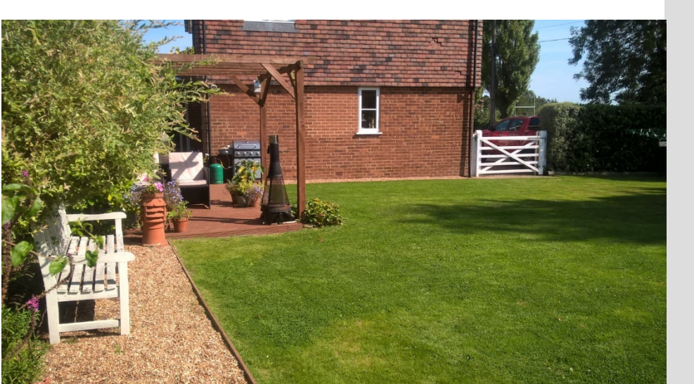
Page 1 of 4

To find out more about the recommended measures and other actions you could take today to save money, visit www.gov.uk/energy-grants-calculator or call 0300 123 1234 (standard national rate). The Green Deal may enable you to make your home warmer and cheaper to run.